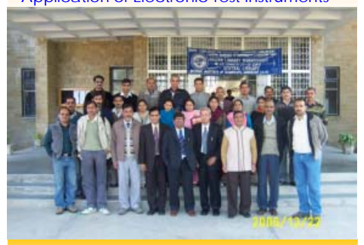
Participants of Short Term Course on "Modern Library Management"