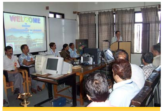
Workshop on "IT Management in Library"