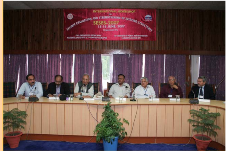
Panel Discussion in Progress During International Workshop SESES – 07 at HIPA, Shimla