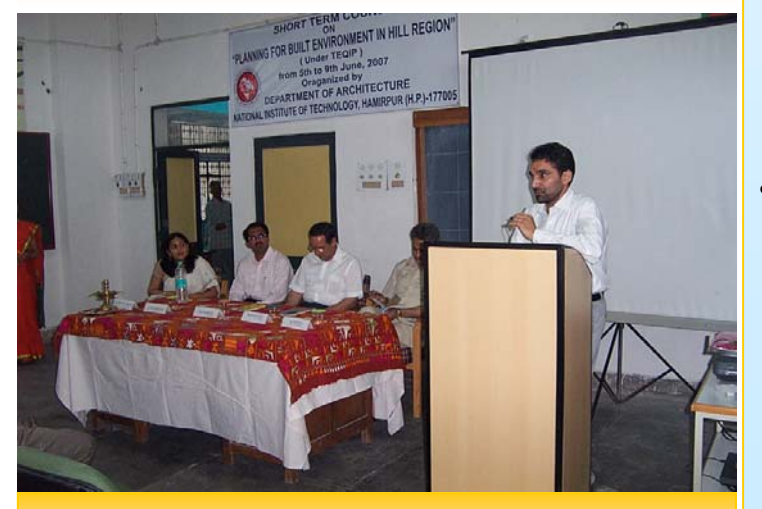
Short Term Programme on "Planning for the Built Environment in the Hill Region"