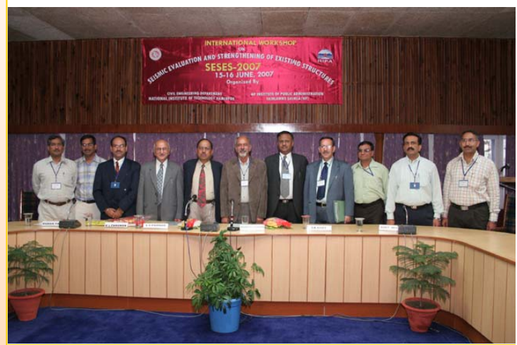
Dignitaries During Inaugural Function of International Workshop SESES – 07 at HIPA, Shimla