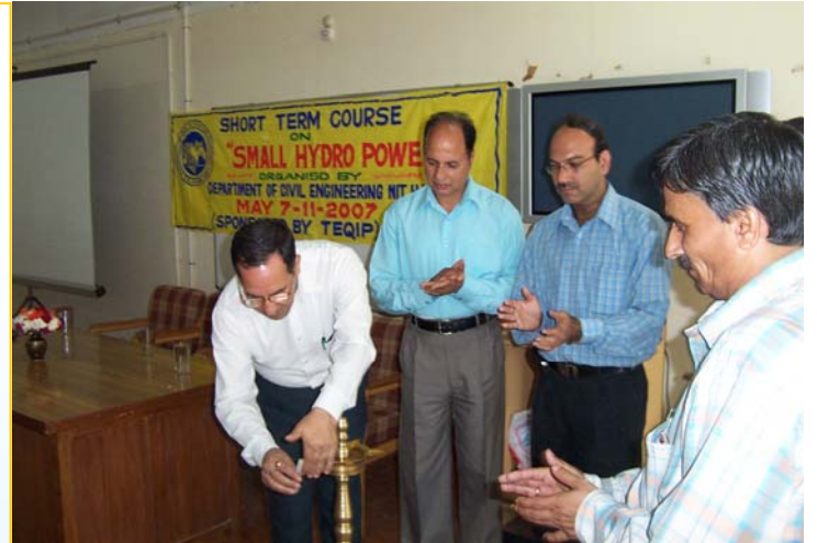
Inaugural Ceremony of STC on "Small Hydro Power"