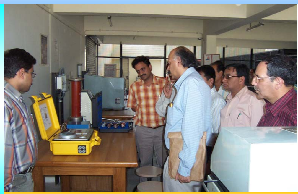
Inspection by World Bank Auditor