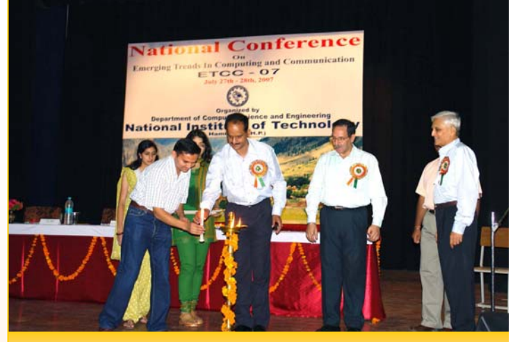
Lamp Lighting Ceremony During Inauguration of National Conference, ETCC – 07

National Conference on "Design Techniques for Modern Electronic Devices, VLSI & Communication Systems DTVC-2007" was organized successfully by E&CED, on 14-15 May 2007 and received over-whelming response from all states of India. The conference was well attended by twelve world renowned academician experts and over hundred delegates from all over the country.