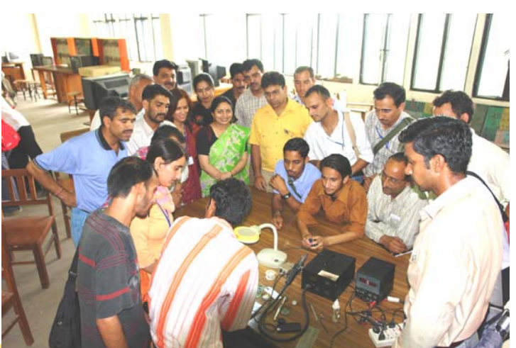
Lab Session on Mobile Repair Being Conducted During the Short Term Course under UPA

Inaugural ceremony of STC on "Fundamentals of Tribology