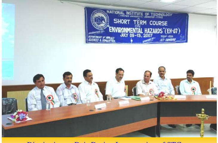
Dignitaries on Dais During Inauguration of STC on Environmental Hazards (EH07)