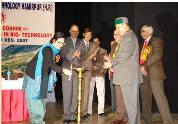
Inaugural ceremony of STC on “Current Inclinations in Biotechnology”