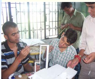
Students at work during the Studio Exchange Programme