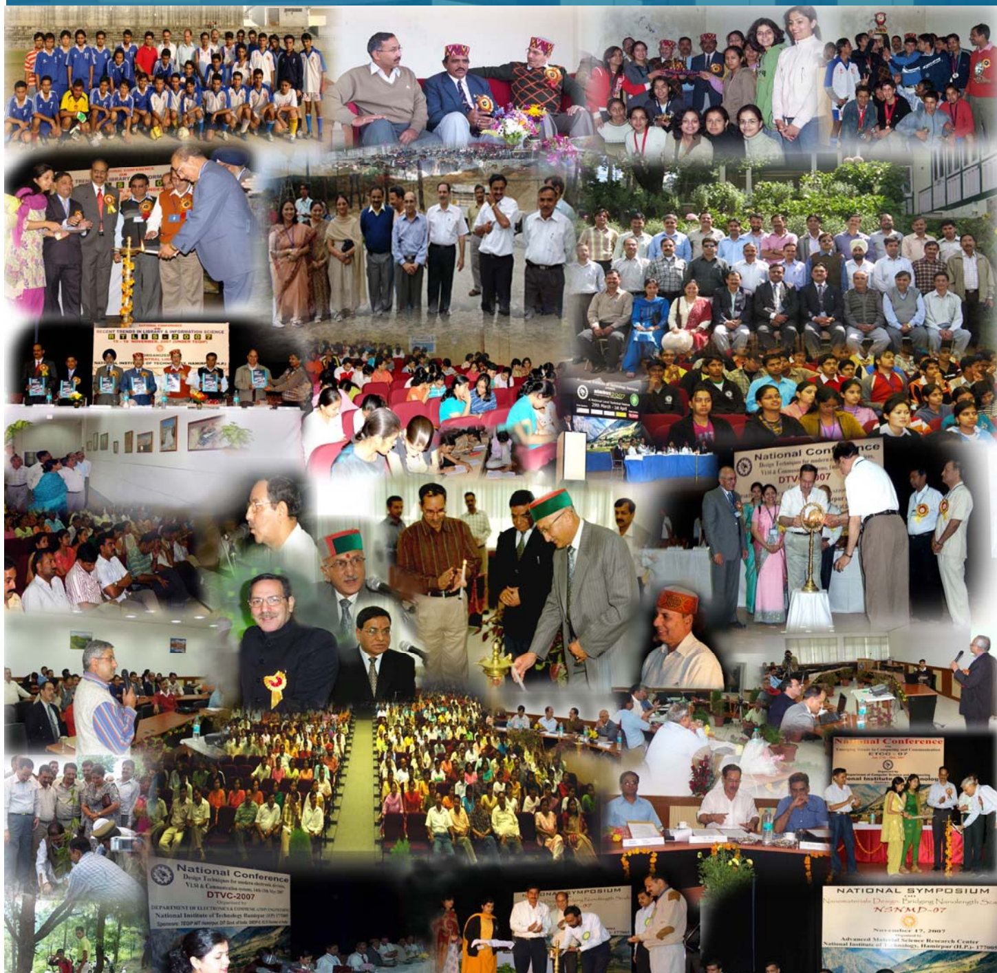
Events of 2007 in NIT Hamirpur

Editorial Board wishes A Happy & Prosperous New Year 2008