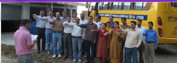
Faculty and staff of NIT Hamirpur taking pledge on International Peace Day

The International Peace Day on 2 nd October, 2007 was observed by the faculty and staff of NIT, Hamirpur. The UN has declared to observe the birth anniversary of the father of the nation Sh. Mahatma Gandhi as International Peace Day from this year. On this occasion a pledge was taken by all to contribute towards maintaining world peace.