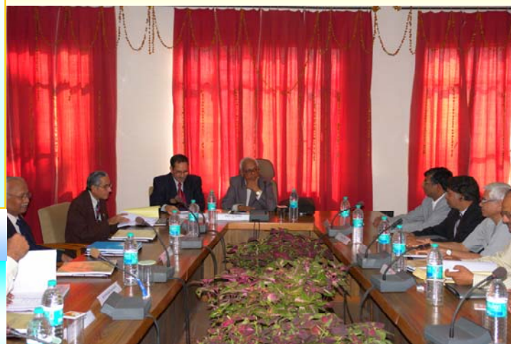
Director discussing with Accreditation team