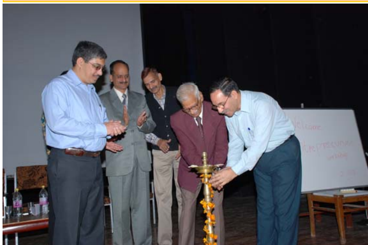
Inaugural ceremony of "E-Workshop - 2007 "