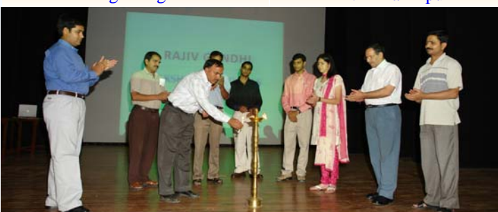
Urja Diwas celebrated in NIT Hamirpur