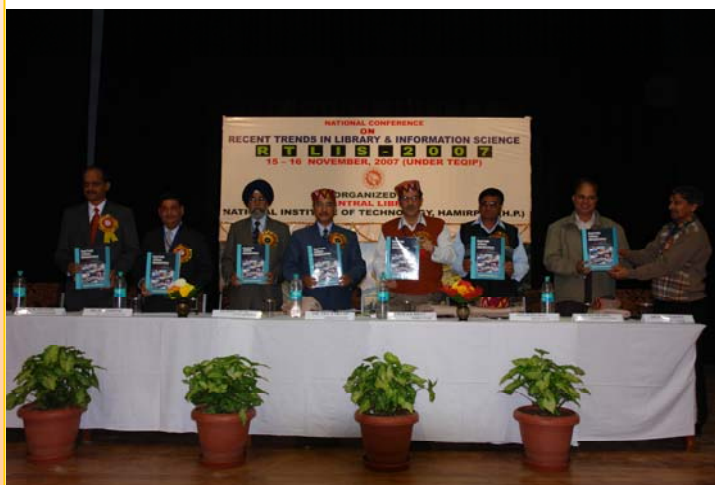
Proceeding inauguration on "Recent Trends in Library & Information Science" RTLIS-07