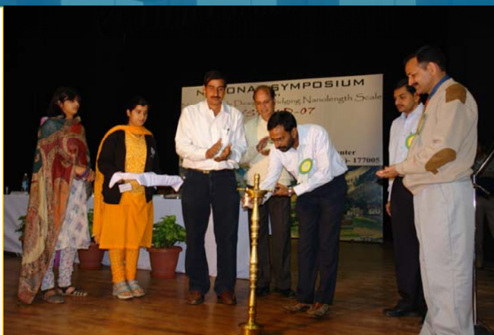
Lamp lighting Ceremony during National Symposium on "Nanomaterials Design: Bridging Nanolength Scale" (NSNMD-07).

• Computer Science and Engineering Department of NIT, Hamirpur imparted training on C-Sharp, Advanced Java, VB .Net, ASP .Net to faculties of Punjab Technical University from 16th-18th December 2007.