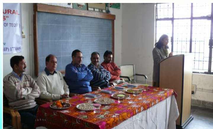
Inaugural ceremony of the Short Term Course on “Managing Architectural Data in Computers”