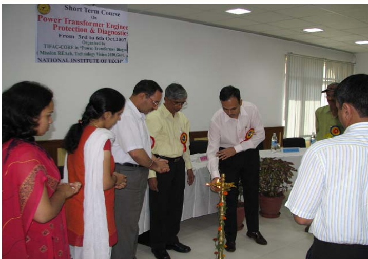
Inaugural ceremony of STC on "Transformer Engineering, Protection and Diagnostics"