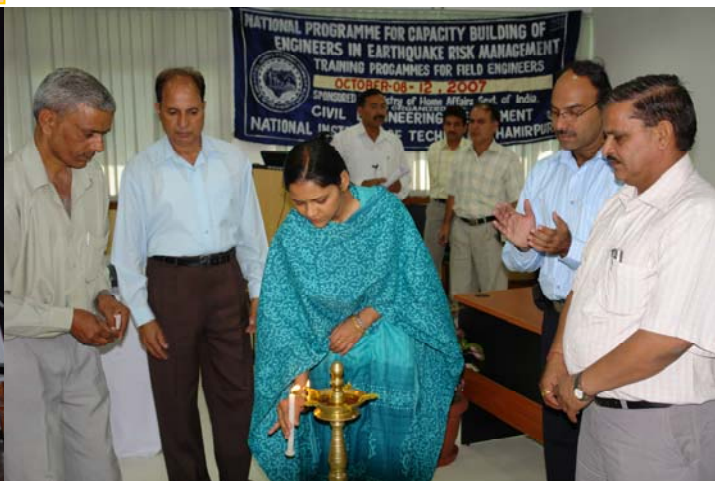
Inaugural ceremony of "National programme for capacity building of engineers in earthquake risk management"