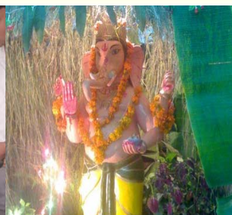
Sri Sri Ganesh Puja celebrated in NIT Hamirpur