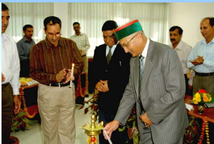
Inaugural ceremony of 3 rd "Registrar Meet"

The agenda items discussed and recommended are Restructuring of non-teaching staffs and implementation of NIT Act -2007.