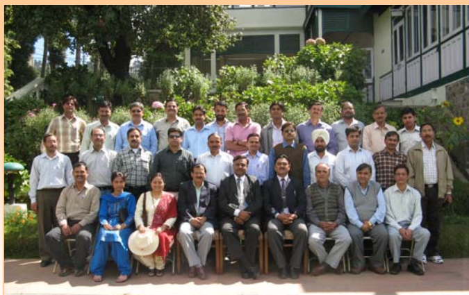
Group Photograph during Training Programme on Store Management & Financial Administration