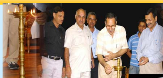
Inaugural Function of Hindi Diwas -2009