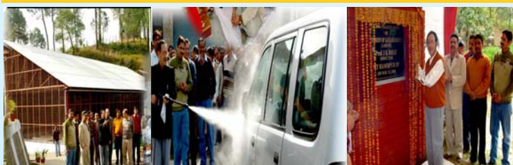
Garbage Disposal System, Car wash centre, Extension to Boys Hostel