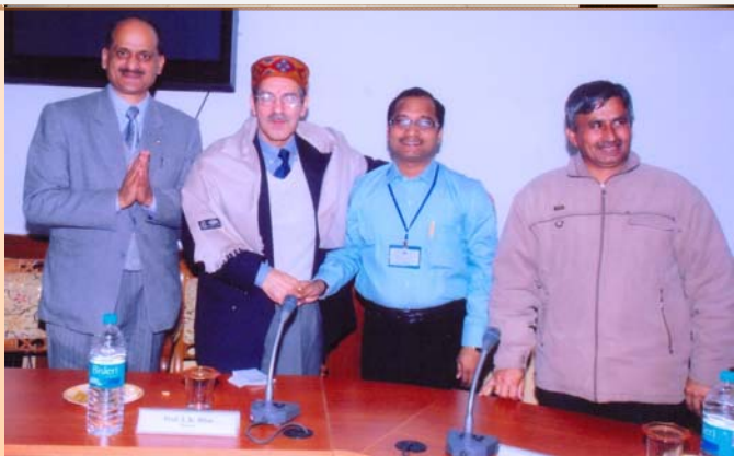
Winter School on Advances in Optical and Wireless Communication