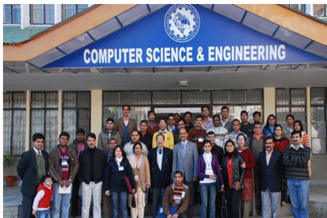
Winter School on "Cloud Computing"