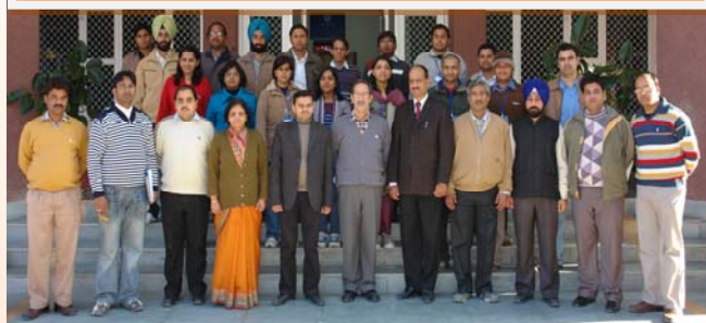
Winter School on "Linux System Administration"