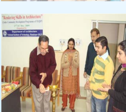
Rendering Skills in architecture