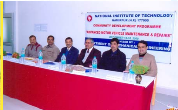
Advanced Motor vehicle Maintenance and Repairs