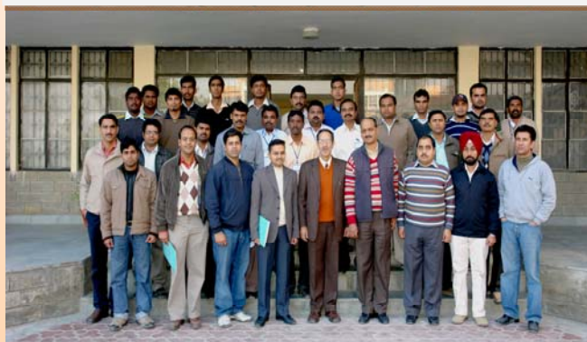
Winter School on "Internet Technologies"