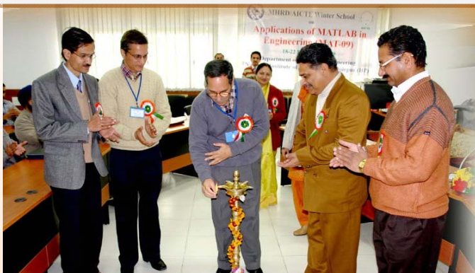
STC on "Micro and Nano Composite Materials"