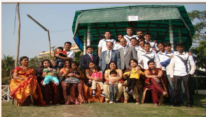
Snapshot of US local Chapter of Alumni Association