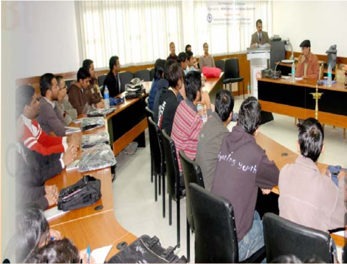
Business skill development program