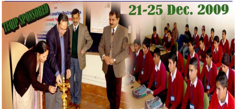
Course on electrical measurement instruments for school children