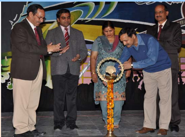
Lamp lighting Inaugural Function Hillffair'09