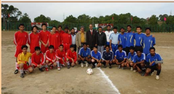
All India inter NIT football tournament