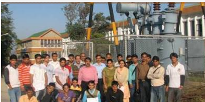
Inaugural of Winter School on Applications of MATLAB