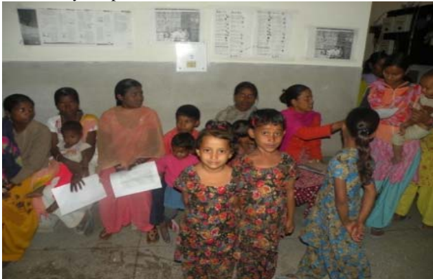
Free medical check-up camp for PRAYAS