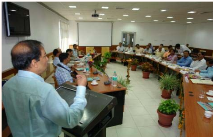
NIT Dean Student's meet inauguration October 9 th , 2009