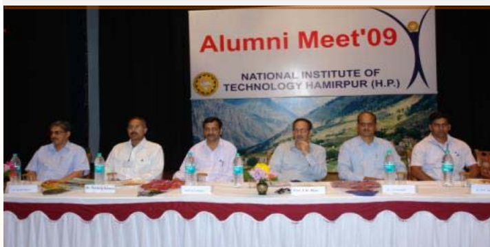
Snap shot of Kolkata-North East Alumni Local Chapter