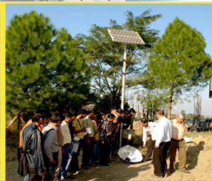
Repair and Maintenance of Solar and Photovoltaic Systems