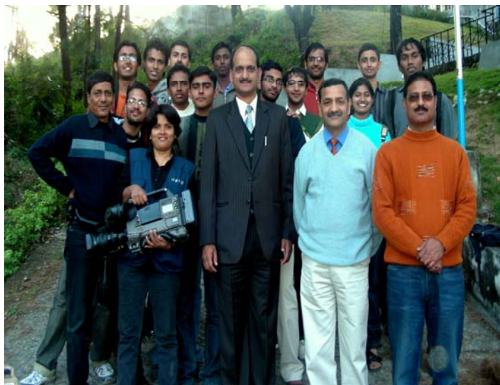
"Challenge Chatney", Department of Science and Technology program, Government of India