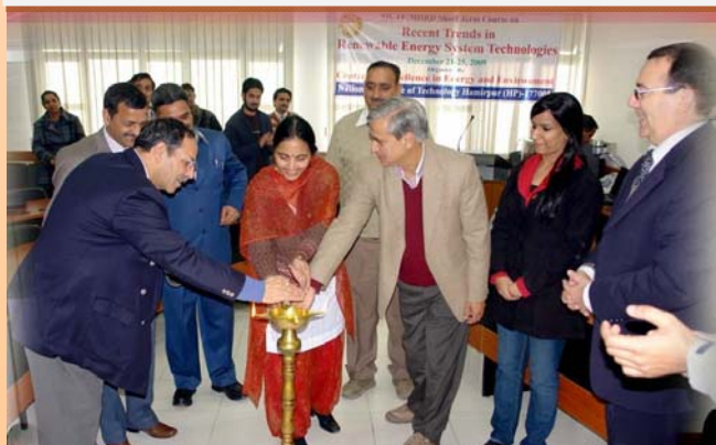
STC on "Recent Trends in Renewable Energy System Technologies"