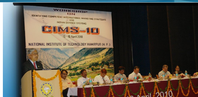
Inauguration of workshop on Competent International Marketing Strategies