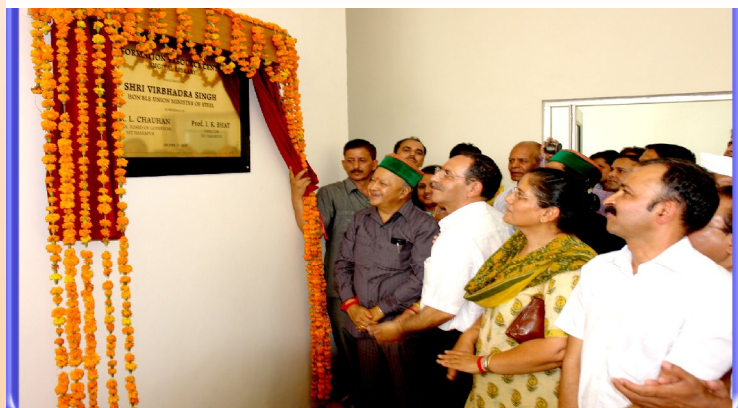
Inauguration of Information Resource Centre (Digital Library)