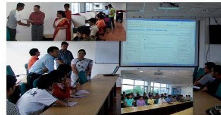
Hon'ble Director with participants of PROJA-10