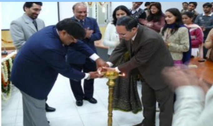
Inauguration of AICTE/MHRD sponsored winter school Building systems for urban and rural areas