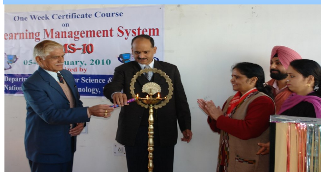
Inauguration of course on e-Learning Management Systems