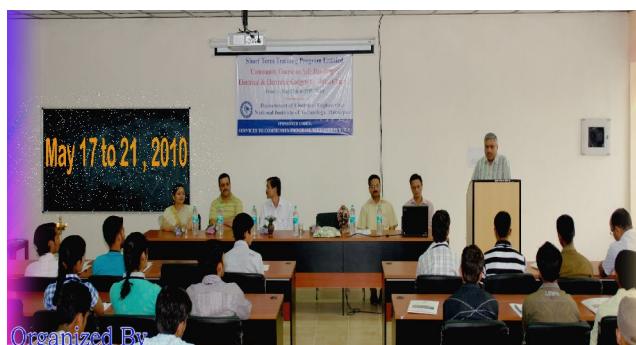
Inauguration of STTP on Safe Handling of Electrical Gadgets for rural citizens