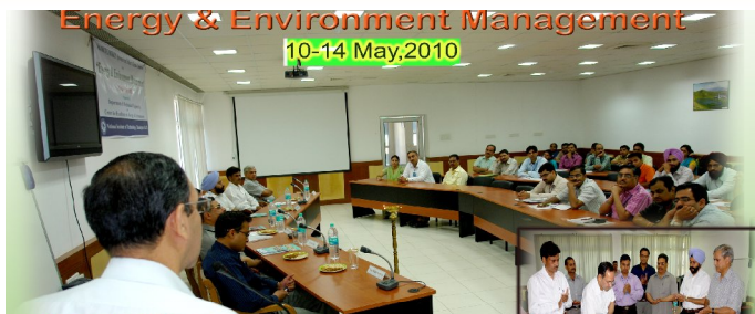
Inauguration of AICTE/MHRD sponsored Energy and Environment Management