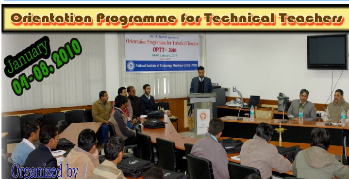
Participants of short term course Orientation Programme for technical teachers. OPTT-2010