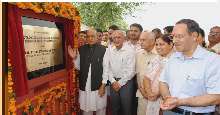
Foundation Stone of Electronics Engineering Department and Material Science Centre