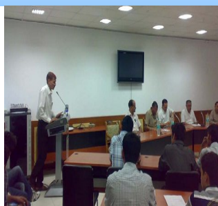
Workshop on Tips for Civil Services Exam