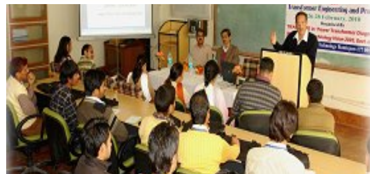
Short Term Training Program (STTP) on "Power Transformer Engineering & Practices"