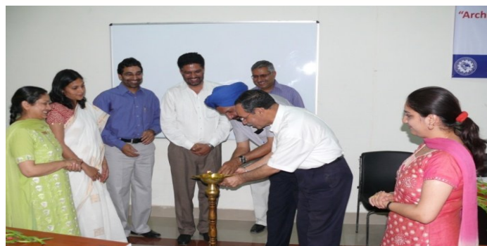
Inauguration of workshop on "Architectural Journalism and Photography building systems