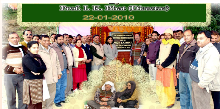
Foundation Stone of Industrial Research Centre