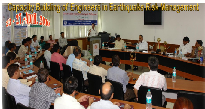
Inauguration of Training Programme on “Capacity Building of Engineers in Earthquake Risk Management