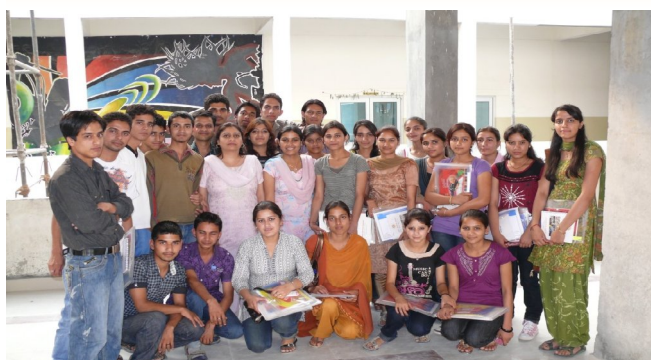
Participants of Course on New Construction Techniques